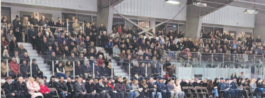
Over 500 people attended Remembrance Day service at East End Arena.